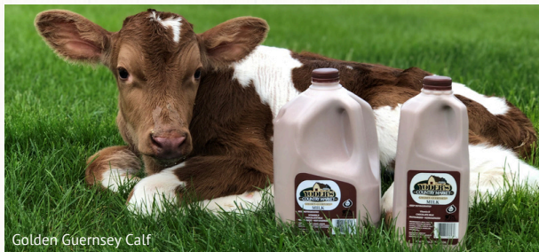
Golden Guernsey Calf